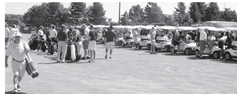
Below - Getting organized at the Legault golf tournament - a capacity crowd of their customers, employees and business associates from across Ontario and beyond came to support this event.